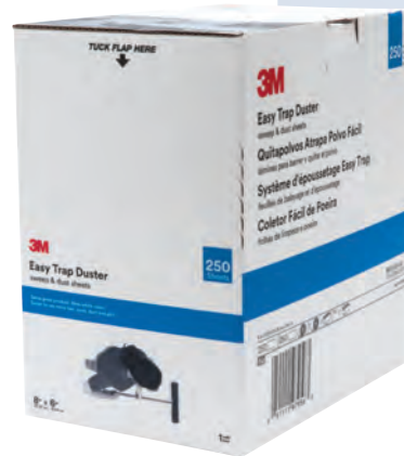
3M™ Easy Trap Duster sweep & dust sheets, 8" roll