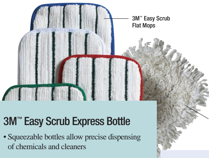
3M™ Easy Scrub Flat Mops