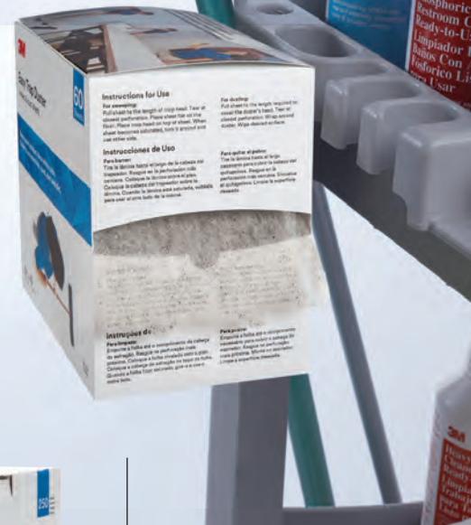
Easy mounting mini-dispenser