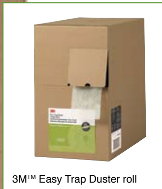
3M™ Easy Trap Duster roll