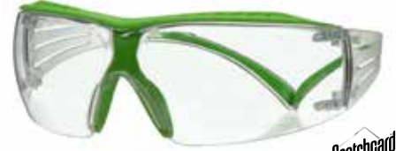
SF401XSGAF-GRN Lens: Clear | Frame Color: Hi-Vis Green/Clear