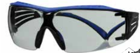
SF407XSGAF-BLU Lens: I/O Gray | Frame Color: Blue/Gray