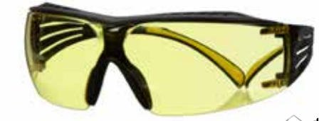
SF403XSGAF-YEL Lens: Amber | Frame Color: Yellow/Black