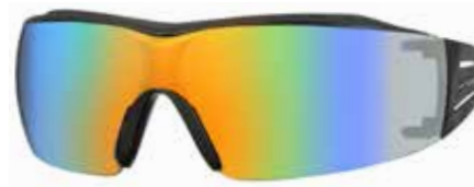
SF416XAS-BLK Lens: Orange Mirror | Frame Color: Gray/Black