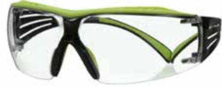
SF401XAS-GRN SF401XAF-GRN Lens: Clear | Frame Color: Green/Black