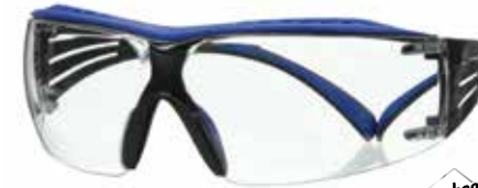
SF401XSGAF-BLU Lens: Clear | Frame Color: Blue/Gray