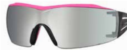
SF409XAS-PNK Lens: Silver Mirror | Frame Color: Pink/Black