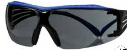
SF402XSGAF-BLU Lens: Gray | Frame Color: Blue/Gray