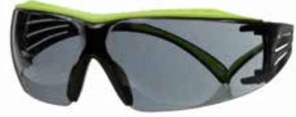
SF402XAS-GRN SF402XAF-GRN Lens: Gray | Frame Color: Green/Black