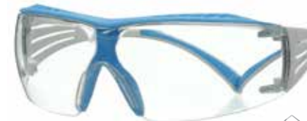
SF401XSGAF-WHT Lens: Clear | Frame Color: Light Blue/White