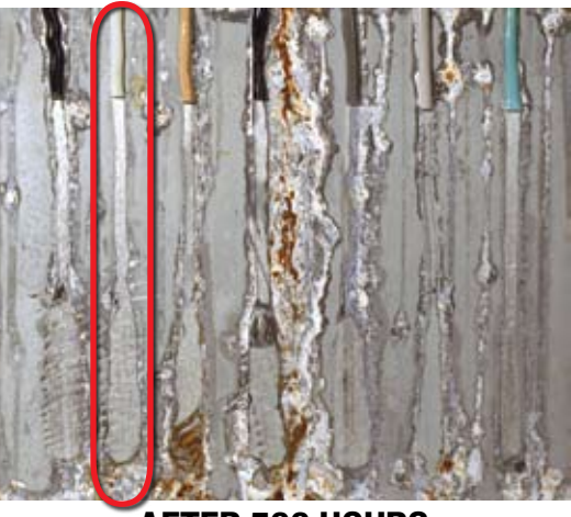
AFTER 500 HOURS

Please recycle. Printed in U.S.A. 3M is a trademark of 3M. © 3M 2008. All rights reserved. 60-4401-0283-2