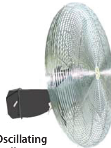
Oscillating Wall Mount