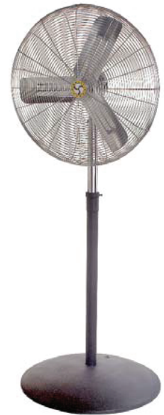
Oscillating Adjustable Pedestal