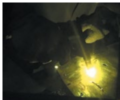
Non HD Competitor lens

FOR MORE INFORMATION, TO SCHEDULE A FREE DEMO OR TO ORDER: