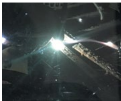
HD lens ArcOne HD lens

See color in its truest form with ArcOne's exclusive HD technology. This innovative feature increases the range of visible light when looking through the welding lens. This means you'll see more natural colors, providing a clearer, more defined view of your work area.