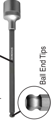
Ball End Tip

ProGuard™ finish delivers superior corrosion protection