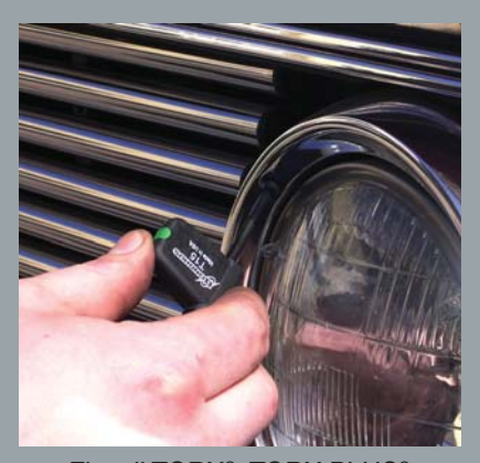
Fits all TORX®, TORX PLUS® and Star screws