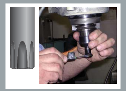
Chamfered tool tips eliminate burrs and help tools seat in screw head