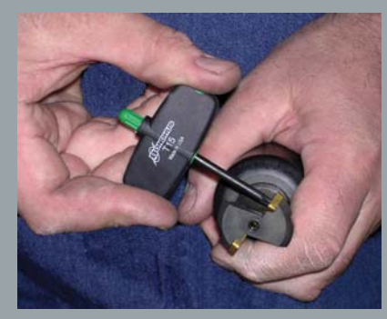
ComfortGrip handles feature a durable solid core wrapped in cushioned rubber for maximum grip and comfort

Environmentally safe, provides better tool grip, resists solvents and is 5 times more corrosion resistant than competitor finishes.