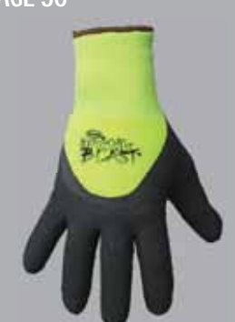
# / 845 PAGE 36