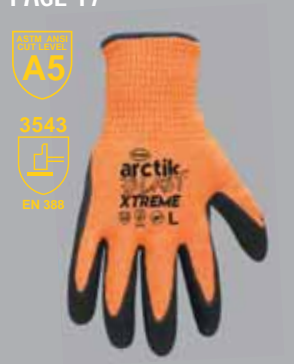
#1CF7008W PAGE 17