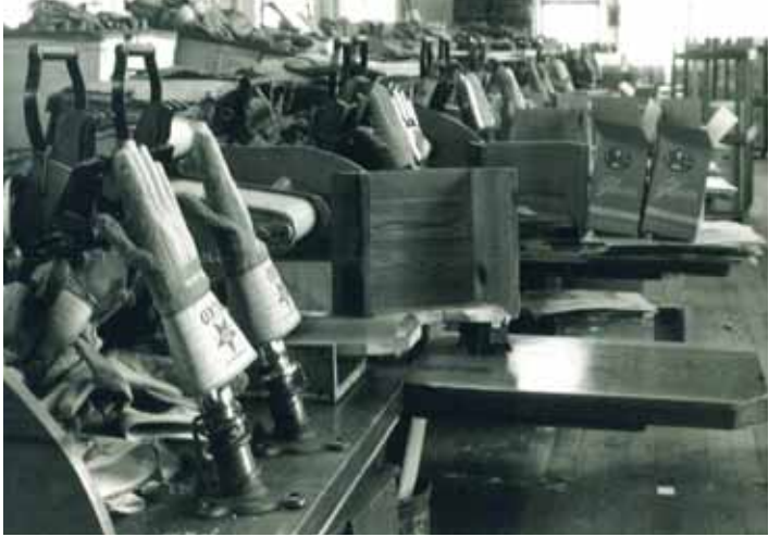
Boss' "FLX0" chore glove being made in Kewanee, IL c. 1940.

In 1893, the Perkins Husker Company was reorganized and emerged as Boss Manufacturing Company. From 1895-1900, in addition to corn husking pins, the company manufactured force pumps and end gates for farmers' wagons. Boss also conceived the idea of manufacturing work gloves by taking note of farmers' needs in the Kewanee area. In the early 1890s it was common practice for farmers' wives to purchase cloth goods and make work mittens for their husbands.