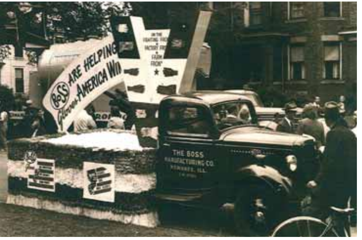
"Boss Gloves Are Helping America Win" - World War II parade float