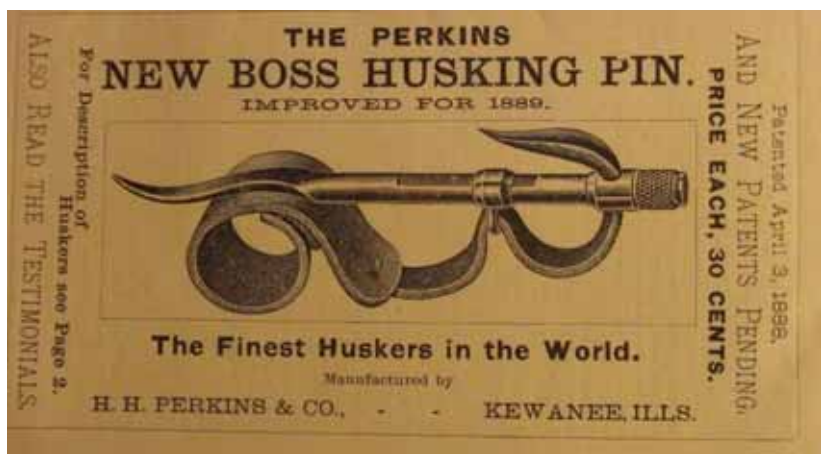
Rendering of The Perkins Boss Husking Pin, 1889.

In 1893, the Perkins Husker Company was reorganized and emerged as Boss Manufacturing Company. From 1895-1900, in addition to corn husking pins, the company manufactured force pumps and end gates for farmers' wagons. Boss also conceived the idea of manufacturing work gloves by taking note of farmers' needs in the Kewanee area. In the early 1890s it was common practice for farmers' wives to purchase cloth goods and make work mittens for their husbands.