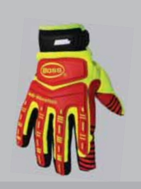
#1JM770 PAGE 34