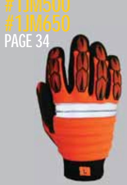
#1JM400 #1JM500 #1 JM650