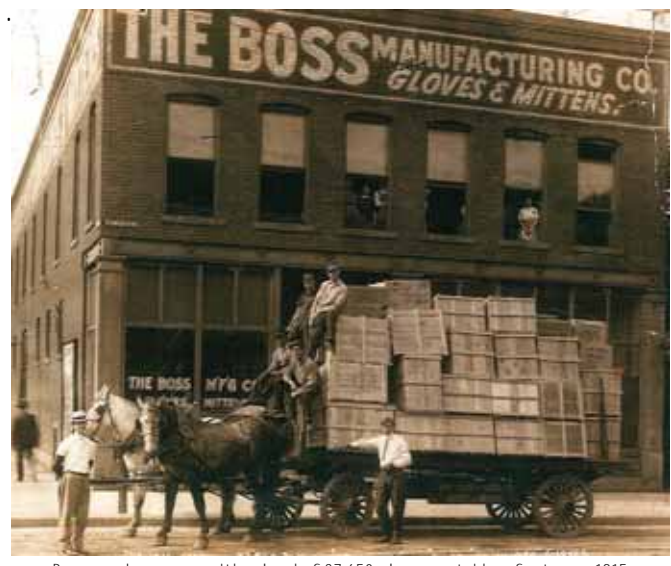
Boss workers pose with a load of 37,650 gloves outside a factory c.1915.

In 1887, a farmer living in Kewanee, Il linois invented a unique corn-husking tool. He named that tool, known today as a husking pin, the Perkins Boss Husker.