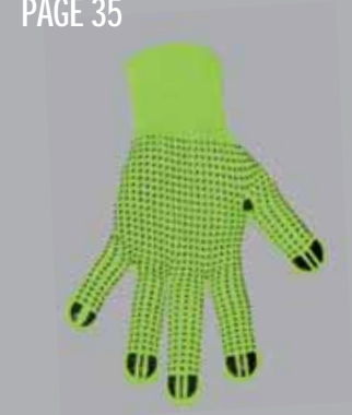
#1JP9522N PAGE 35