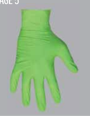
#1UH0004N PAGE 5