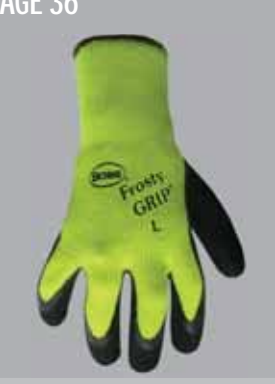
#8439N PAGE 36