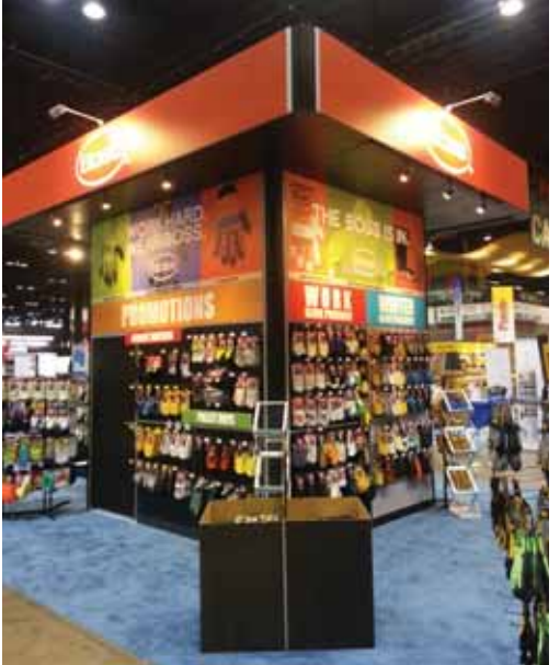
Boss tradeshow booths, showcasing the new look of Boss Manufacturing, 2016.