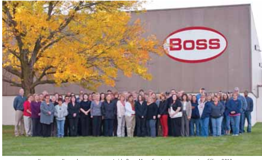
Kewanee, IL employees pose outside Boss Manufacturing corporate office, 2013.

BUILDING GREAT THINGS TAKES TRUST. TRUST IN TALENT. TRUST IN SKILLS. TRUST IN TOOLS. SINCE 1893, INDUSTRIAL WORKERS, RETAILERS, HOBBYISTS, AND DISTRIBUTORS HAVE TRUSTED BOSS MANUFACTURING TO DELIVER THE SAFETY WEAR AND SUPPORT THEY NEED FOR EVERY SITUATION.