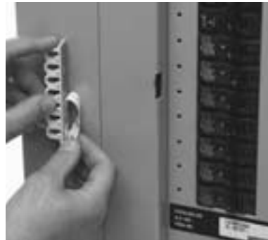
② Peel liner off bottom of lock rail, exposing super-bond adhesive. Permanently affix to any location on the panel. No drilling required!