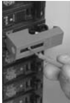
① Lockout device is unlocked by inserting and turning the red plastic key.