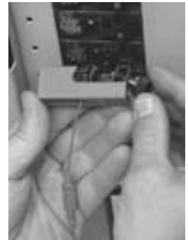
③ Attach the lockout device to the breaker and snap into locked position.