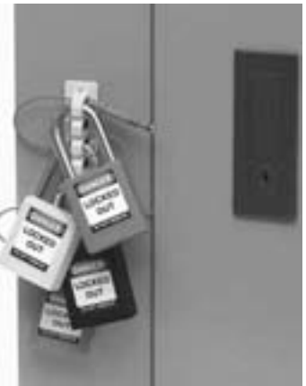
⑥ Low-profile lockouts allow panel doors to be closed on most breaker panels.