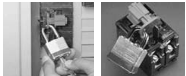
Universal Multi-Pole Lockout works with most two or three pole breakers utilizing a tie-bar.