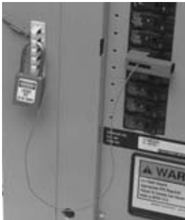
④ Pass plastic key through lock rail and attach lock, preventing key from sliding down cable and opening lockout device.