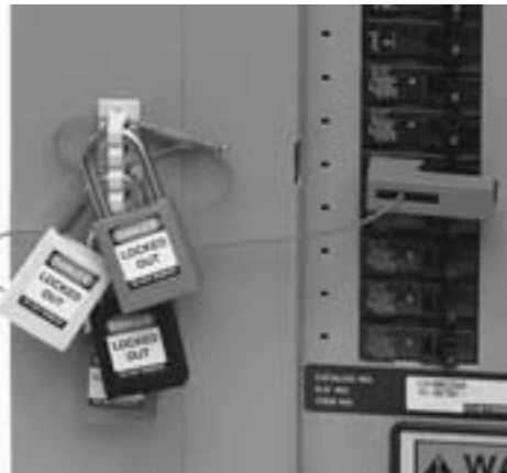
⑤ For group lockouts, run key through multiple loops in lock rail and apply locks. No hasps required!