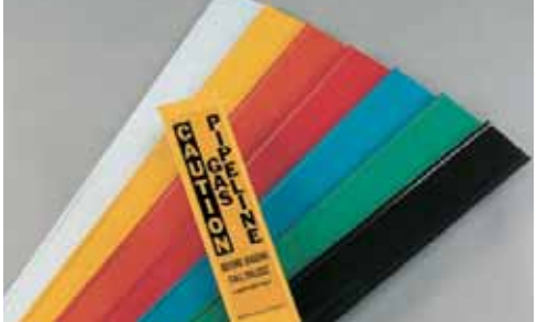
Stakes can be customized with warning stake decals, sold on next page.