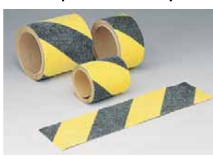
Bright yellow and black Striped Anti-Skid Tape aids visibility of hazardous areas.