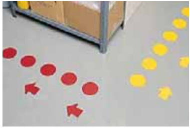
Aisle Marking Dots are perfect for marking short aisles, or around machines, equipment and storage areas.