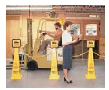
Use Bradycone™ Warning System for any of your hazardous warning needs.