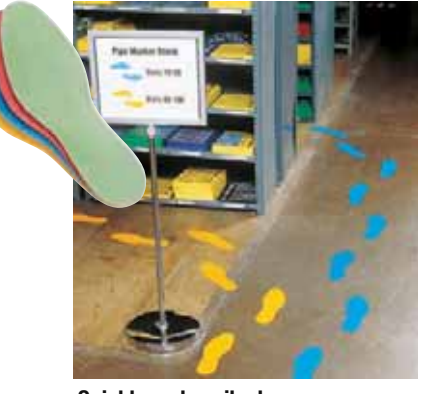
Quickly and easily demonstrate the most efficient workflow procedure using these Removable Footprints.