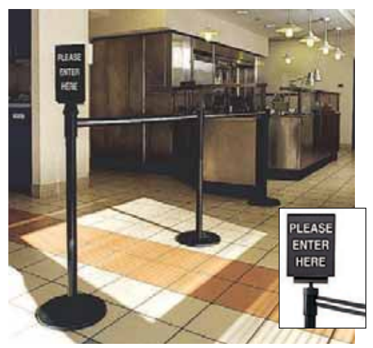
This attractive pedestrian control system is portable and easy to change.