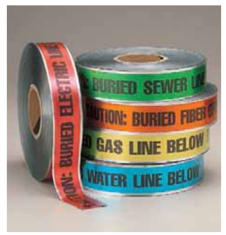
Detectable Identoline® tape minimizes time spent locating buried lines thus reducing field costs. The tape is buried 4" to 6" below the surface for maximum detectability.