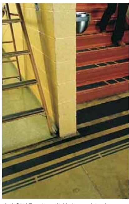
Anti-Skid Tape is available in a variety of colors for any floor marking needs.