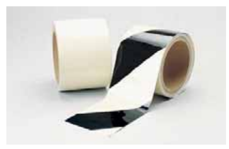
Use Brady "Glow-in-the-Dark" Tapes for visible marking at night or in low light conditions.