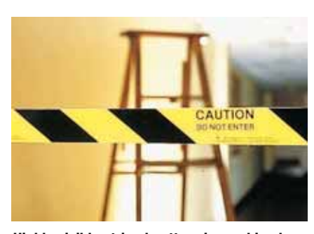
Highly visible striped pattern is combined with a worded legend to provide instant recognition of hazard areas.