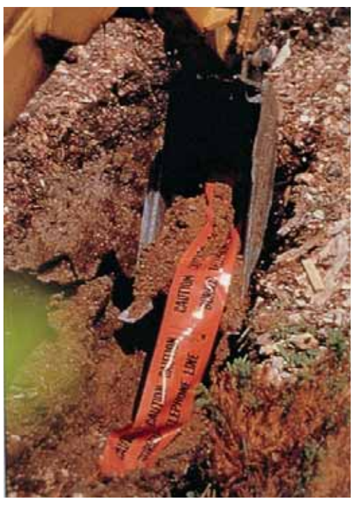
Identoline® Underground Warning Tape is buried 12" to 18" below ground level. Digging crews receive warning of buried lines and cables, allowing a margin of safety between the tape and the buried line.