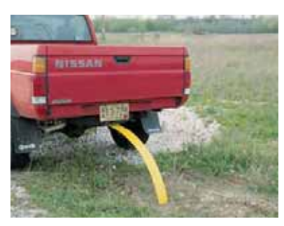
Bradystakes™ are rugged and flexible; even if accidently driven over, they bend, but don't break.