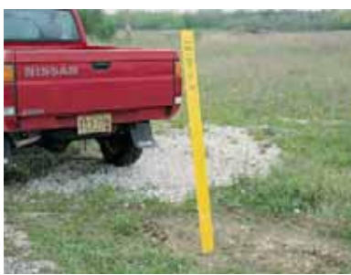
Bradystakes™ are made of tough, reinforced polymer that snaps back to the upright position with no damage.