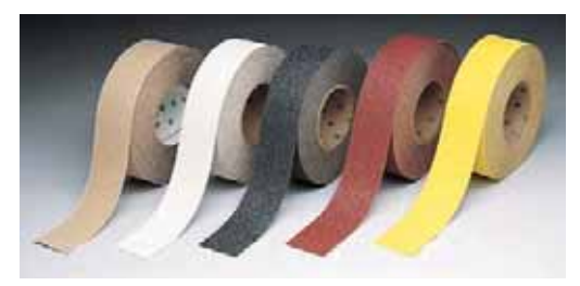
Sure traction of Anti-Skid Tape helps prevent slipping and falling on wet or slick floors.