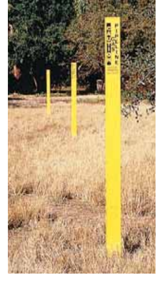
Prevent accidental dig-ins by marking underground gas/oil pipelines, telecommunication cables, electric power lines, and water and sewer lines with Bradystake™ Warning Stakes.