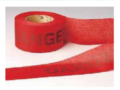
Re-Pulpable Cotton Barricade Tape is ideal where traditional plastic tapes could cause contamination.