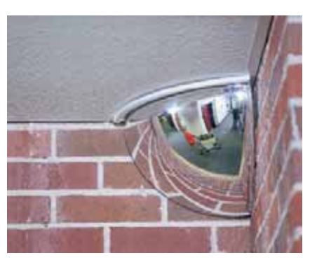
Dome - prevents collision in high hazard areas.