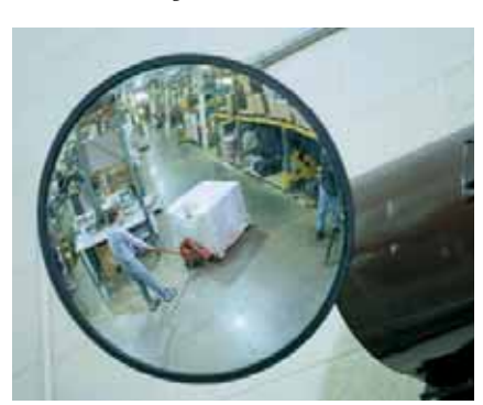
Convex - 60° visibility eliminates blind intersections.