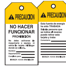
121518 5-3/4" x 3" B-837 25/pk