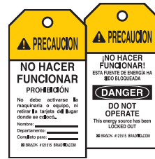
121515 5-3/4" x 3" B-837 25/pk

Includes self-laminate flap to protect face of tag and photo.