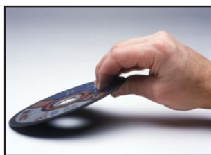
WA36-T - Rigid