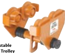
Adjustable Plain Trolley