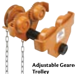
Adjustable Geared Trolley