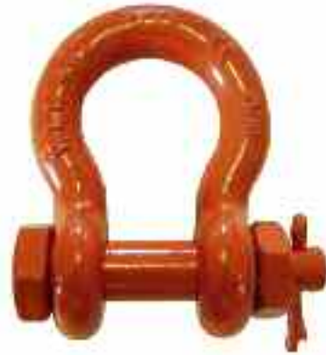
Bolt & Nut