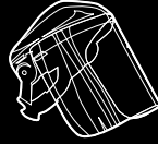
Eye and Face Protection