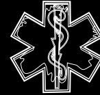
First Aid Products