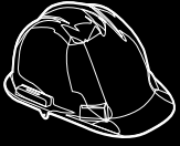
Head Protection ■