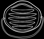
Respiratory Protection ■