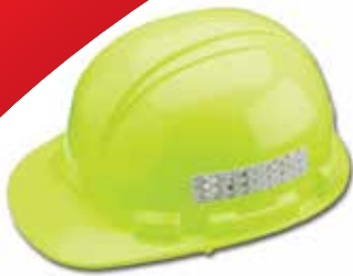
HP1X4WHT Reflective Strips (shown on a HP241/44 hard hat)