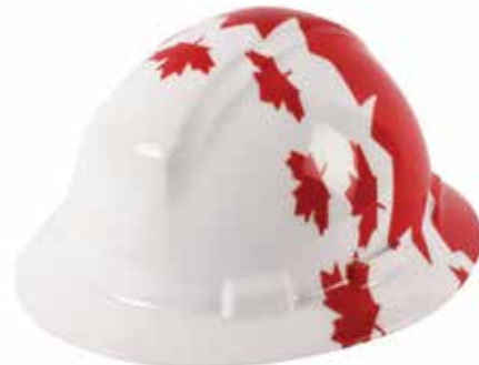
HP641RMPL / HP642RMPL