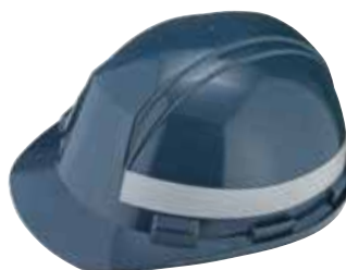
HPSS24 Reflective Strips (shown on a HP542R/08 hard hat)