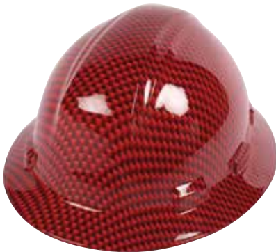
HP641RCAR / HP642RCAR