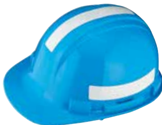
HPSS8 / HPSS83 Reflective Strips (shown on a HP241/07 hard hat)