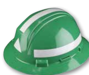
HPSS84 Reflective Strips (shown on a HP641/04 hard hat)