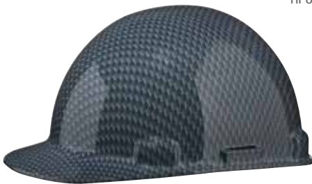
HP341RCAR / HP841RCAR / HP842RCAR