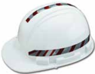
HPHH1RD Reflective Strips (shown on a HP241/01 hard hat)