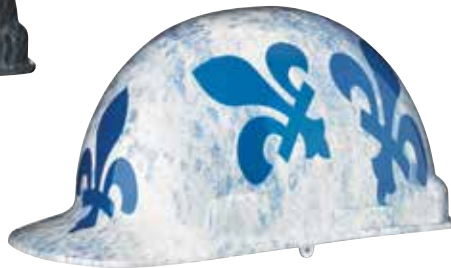
HP341RQUE / HP841RQUE / HP842RQUE