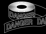
Product Identification ■