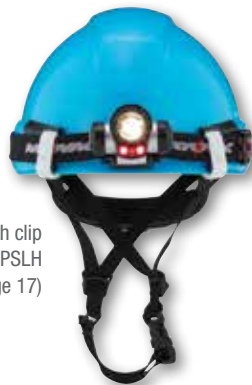
HP142R06 shown with clip for lamp strap HPSLH (See page 17)