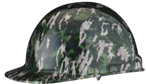
HP341RCAM / HP841RCAM / HP842RCAM