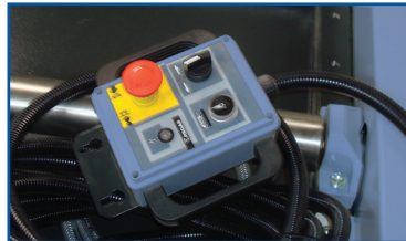
Control panel for lift roller assembly