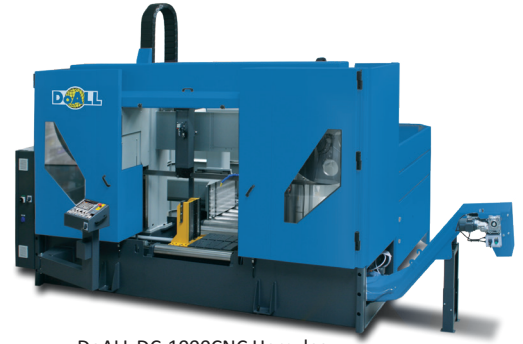
DoALL DC-1000CNC Hercules Dual Column Enclosed Band Saw - 33 1/2 x 40" Capacity