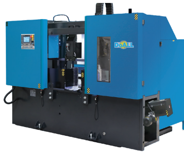
DoALL DC-400CNC Hercules Dual Column Enclosed Band Saw – 16 x 16" Capacity