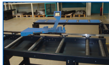
Digital readout back gauge