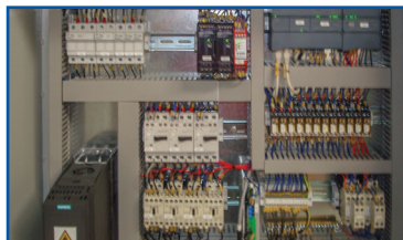
Electrical components panel