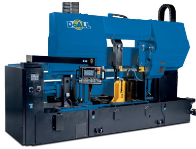
DoALL DC-750CNC Hercules Dual Column Enclosed Band Saw - 28 x 30" Capacity