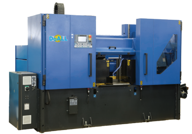
DoALL DC-510CNC Hercules Dual Column Enclosed Band Saw – 20 x 20" Capacity