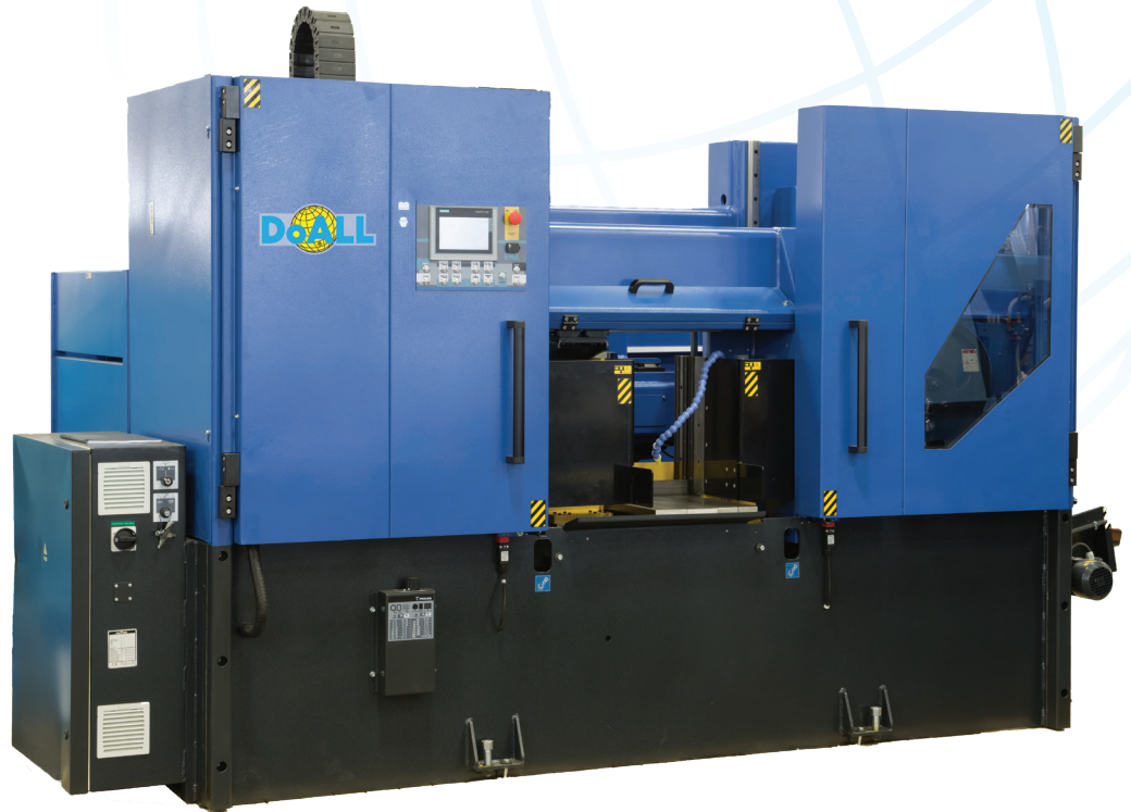
DoALL DC-510CNC Hercules™ Enclosed Band Saw – 20 x 20" Capacity