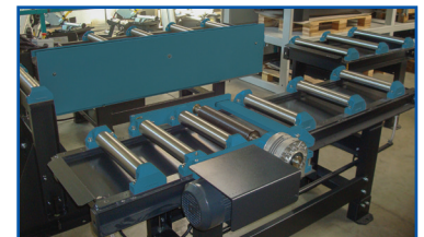
Power lift roller