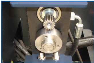
Servo feed control system