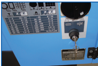
Blade change locking system