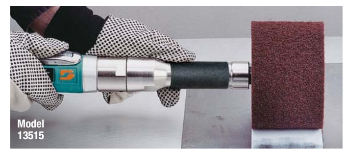
13515 Dynastraight® sets grain pattern in stainless steel.