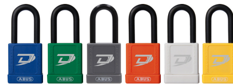
PI7440BKD PI7440GKD PI7440GRKD PI7440OKD PI7440WKD PI7440YKD

Solid recycled aluminum body. Steel shackle lock body encased in anti-scratch vinyl coating. Precision 6-pin cylinder. Opening clearance of 1" (26 mm). A label is supplied with each lock.