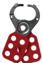
PIASR60ML Jaws opening : 1" Total length : 4.5"

Solid metal hasps with red rubber coating. Can be used with 6 padlocks.