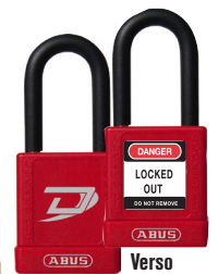
PI7440BKD Verso (Identical for all colors)