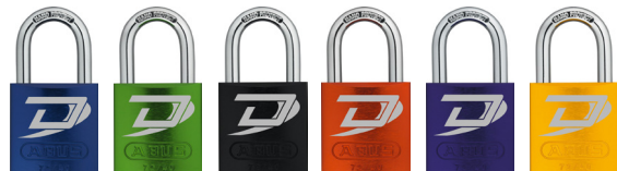
PI721B40BKD PI721B40GKD PI721B40NKD PI721B40OKD PI721B40PKD PI721B40YKD

Body made of solid aluminum. Rekeyable. High precision 6-pin cylinder. Vertical clearance: 1" (26 mm).