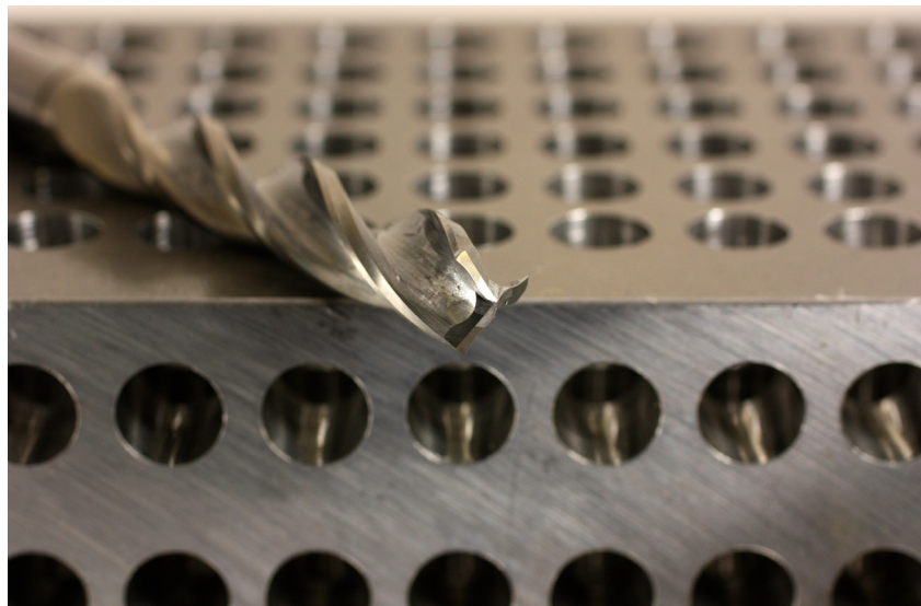
1180 Series High Performance Drill in aluminum reference (pg. 17)