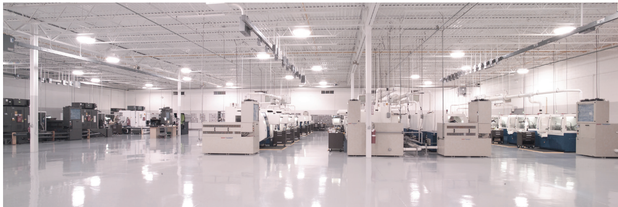
Drill and Reamer Manufacturing