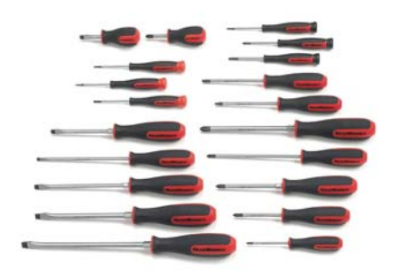
80066 — 20 Pc. Master Dual Material Screwdriver Set

Includes: PH#00, PH#0, PH#1 x 60mm, PH#0, PH#1, PH#2, PH#3, Slotted 1.5, 2.0, 2.5mm, Slotted 3/16", 1/4", 5/16", 3/8", Torx T15, T20