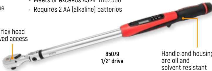
85079 1/2" drive

Handle and housing are oil and solvent resistant