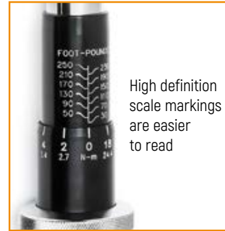
High definition scale markings are easier to read