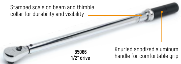
85066 1/2" drive