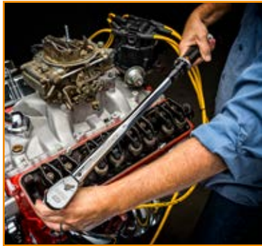
85176 3/8" drive