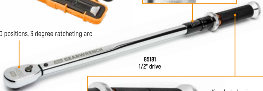
85181 1/2" drive