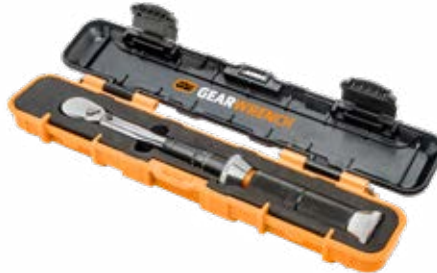
120 positions, 3 degree ratcheting arc