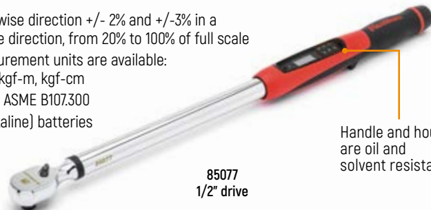
85077 1/2" drive

Handle and housing are oil and solvent resistant