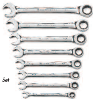
SAE Open End Ratcheting Wrench Set