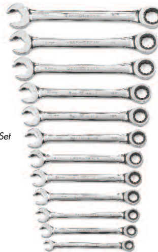
Metric Open End Ratcheting Wrench Set