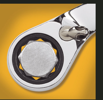
Surface Drive<sup>®</sup> provides a stronger grip on fasteners.