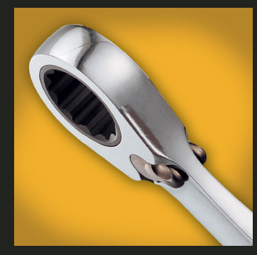
Dual access reversing levers allow you to switch from left to right without removing the wrench.