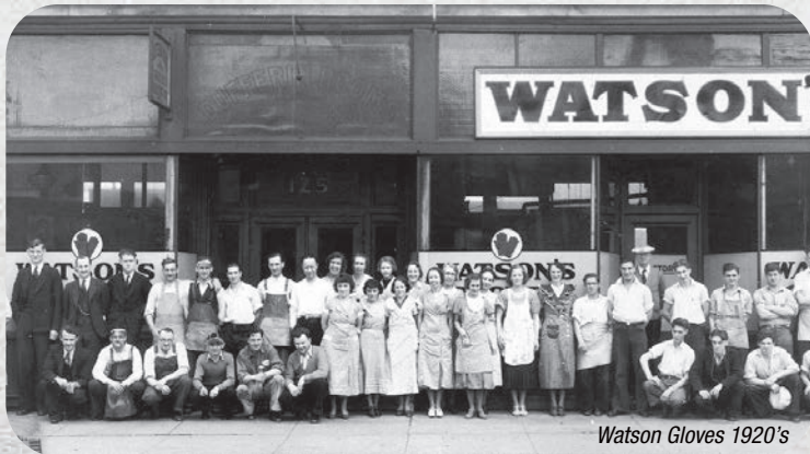
Watson Gloves 1920's