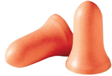
Max Small® Comfort for smaller ear canals

NRR 30 LPF-1 LPF-30 CAN A(L) uncorded corded