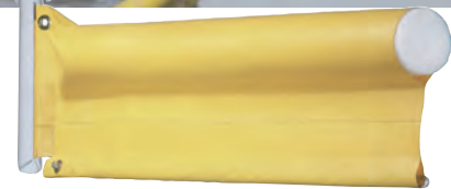
Designed as a containment barrier to prevent spills from spreading