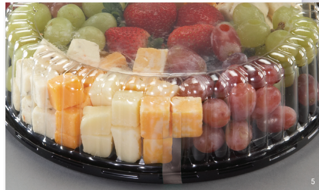
Hold plastic party tray lid with Scotch® Transparent Film Tape 605