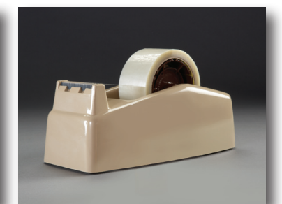
Scotch® Heavy-Duty Tabletop Dispenser C22 for pull and tear convenience.