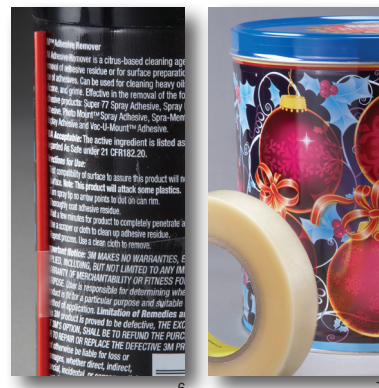
Attach applicator tube to aerosol can with Scotch® Transparent Film Tape 600.