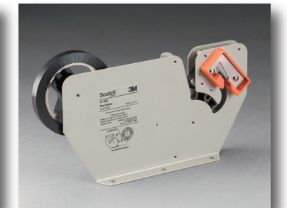
Scotch® Bag Sealer P400 applies tape in an adhesive-to-adhesive flag seal, includes bag trimmer.