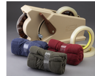
Scotch® Definite Length Dispenser M96 dispenses pre-set lengths of .75" to 5" per stroke.