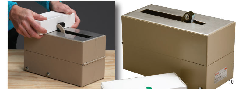
Scotch® Manual Dispenser S63 applies a neat, consistently sized L-clip of tape in a single pass of a box.