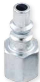
A TYPE PLUG - FEMALE