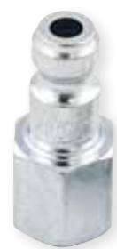
T TYPE PLUG - FEMALE