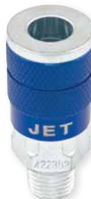
T TYPE COUPLER - MALE