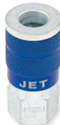
T TYPE COUPLER - FEMALE