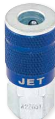
A TYPE COUPLER - FEMALE