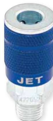
A TYPE COUPLER - MALE