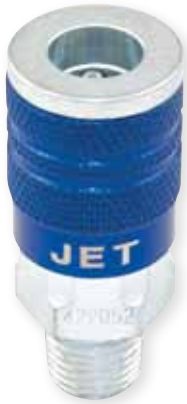
I/M TYPE COUPLER - MALE

Please note: Products supplied in blister packs are sold as a single unit. Products sold in bulk packs are sold by the each but must be ordered in bulk pack quantities (i.e. 10 or 20) or multiples thereof. Bulk packs will not be sold in less than package quantities.