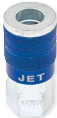
I/M TYPE COUPLER - FEMALE