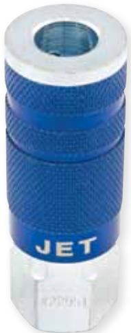
L TYPE COUPLER - FEMALE