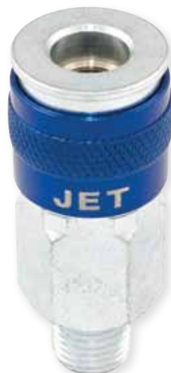
U TYPE COUPLER - MALE