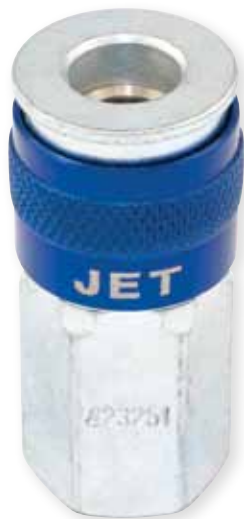
U TYPE COUPLER - FEMALE