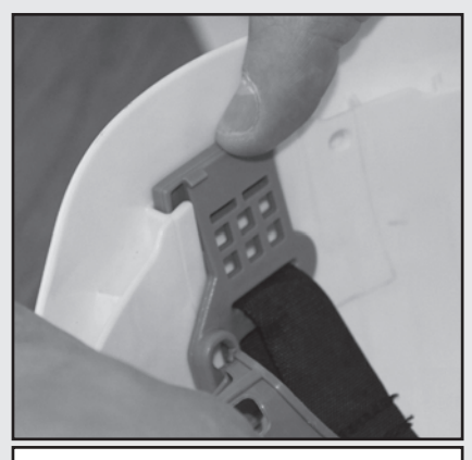
STEP 4: Repeat for all four clips making sure they are firmly pressed in place.

STEP 3: Align the clips with the slots in the helmets shell and push downwards until you hear the clip click into place.