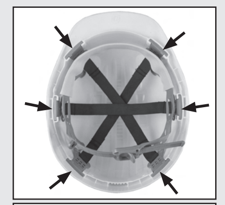
STEP 1: Locate the six clips on the inside of the helmet.