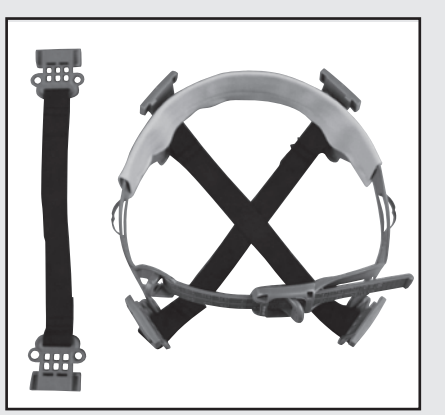
STEP 1: Before fitting the replacement harness make sure you have all the components of the new harness pictured above and the helmets shell from before.