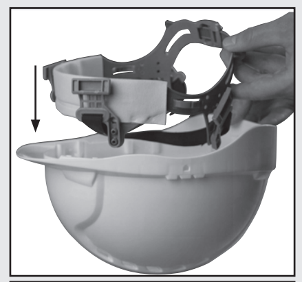
STEP 2: Place the slip ratchet and head piece into the helmets shell making sure the sweatband is at the peak and the slip ratchet is at the rear.