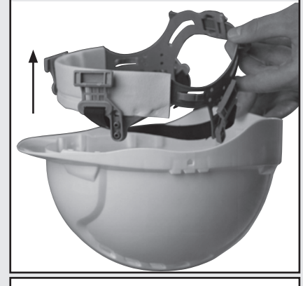
STEP 4: Remove the old harness from the helmets shell.

Warning: Failure To Replace The Harness Correctly Will Compromise The Performance Of The Helmet