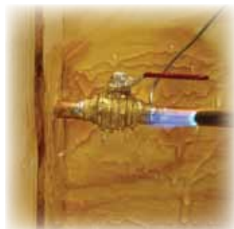
With Cool Gel®