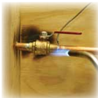
Without Cool Gel®