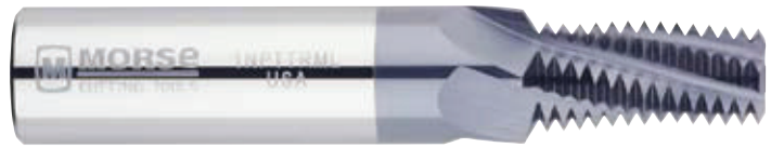
List No. 5902 Pipe Thread