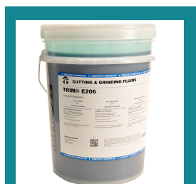
5-gallon pail SKU: E206N/5 UPC-12: 641238003083