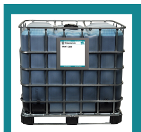
270-gallon tote SKU: E206N/NR270P UPC-12: 641238033882

TRIM® E206 | ©2004-2019 Master Fluid Solutions® | 2019-06-15