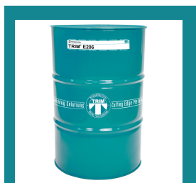
54-gallon drum SKU: E206N/54 UPC-12: 641238003090