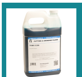
1-gallon jug SKU: E206N/1 UPC-12: 641238003052