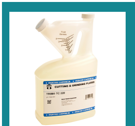
2-quart tip "N" measure® SKU: TC220/AD UPC-12: 641238018094