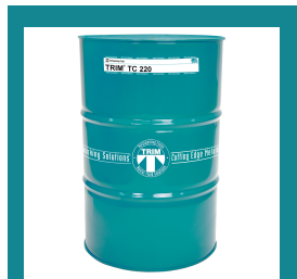
54-gallon drum SKU: TC220/54 UPC-12: 641238011446