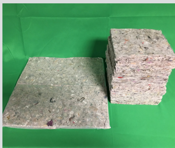
Spilltration Husky Pads absorb oils while allowing clean water to filter through