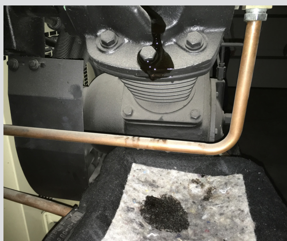
8" x 8" Spilltration Pads are designed to fit as liners for 8" x 8" Spilltration Basin

Spilltration Husky Pads are engineered to absorb oil leaks and drips in the toughest spots at workplaces in the outdoors while filtering clean water at the same time.