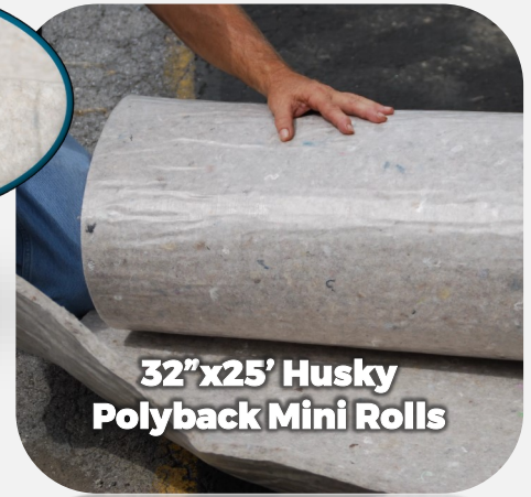
32\"x25' Husky Polyback Mini Rolls