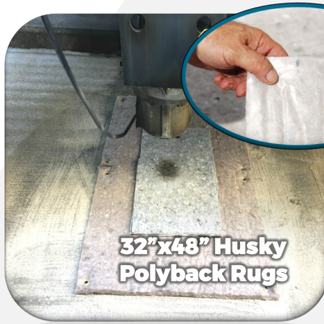
32\"x48\" Husky Polyback Rugs