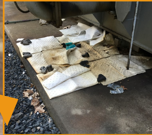
Stains where oil has washed away from spill pads.

Look familiar? Water ‘beads up’ on white pads. This prevents oil from reaching the fibers, causing excess oil to wash away.