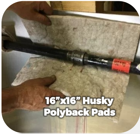
16\"x16\" Husky Polyback Pads