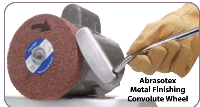
Abrasotex Metal Finishing Convolute Wheel