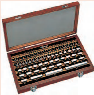
Steel 112-block set