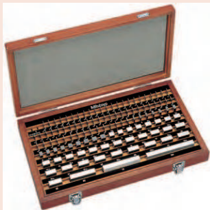
Steel 103-block set