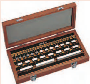
Steel 47-block set