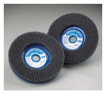
NON-WOVEN ABRASIVE BRUSHES