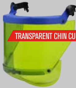
TRANSPARENT CHIN CUP