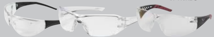
▲ TRANZMISSION PAGE 195