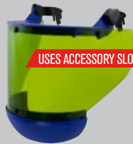
USES ACCESSORY SLOTS