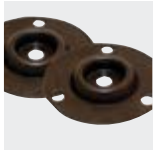
RUBBER BASE MOUNT 939-EFBASE