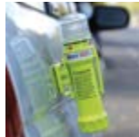
MAGNETIC CLIP 939-EFMAGCLIP