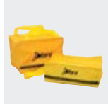
STORAGE BAGS 939-EFBAG-2 - 2-Pack Bag 939-EFBAG-4 - 4-Pack Bag