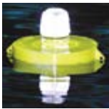
FLOTATION COLLAR 939-EFFCOL/L