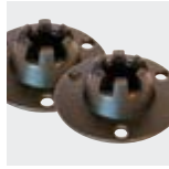
AVIATION BASE MOUNT 939-EFAVBASE