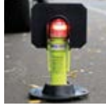
DAYLIGHT HOOD 939-EFHOOD