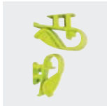
CONE MOUNTING CLIP 939-EFCLIP