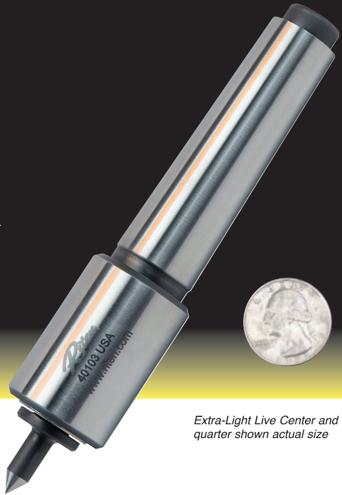
Extra-Light Live Center and quarter shown actual size