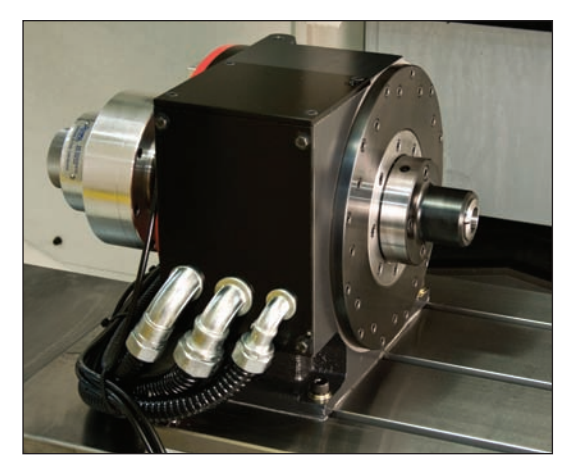
Royal collet closers are well-suited for use in fourth and fifth-axis workholding applications.