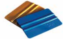
3M™ Hand Applicator PA1-Blue and PA1-Gold Reusable squeegee-type applicator for smoothing film during installs.