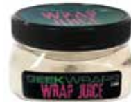
Geek Wraps® Wrap Juice For use with Comply™ Adhesive films to help squeegees easily glide over warmed film.