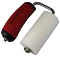
3M™ Textured Surface Applicator TSA-1 Conforms large areas of film onto textured surfaces.