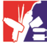
3M Advanced Installation Training

Professional installers who pass unique 3M installation testing programs will be designated as the best in the business. If your installation skills need a little fine tuning, we can give you personalized advanced training to get you prepared for an installer testing program.