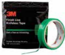
3M™ Finish Line Knifeless Tape Easily cuts most vinyl wrap films — complete installations without a blade.