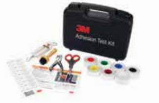
3M™ Adhesion Test Kit for SMOOTH Substrates ATK-1 Instructions, instruments and film samples to perform adhesion value testing.