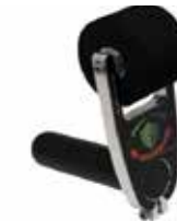
Geek Wraps® Air Wrangler Torch Roller Helps to apply film to rivets and textured surfaces.