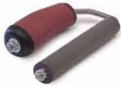
3M™ Rapid Roller Applicator CPA-2 Exclusively for applying 3M™ Controltac™ Graphic Films with Comply™ Adhesive.