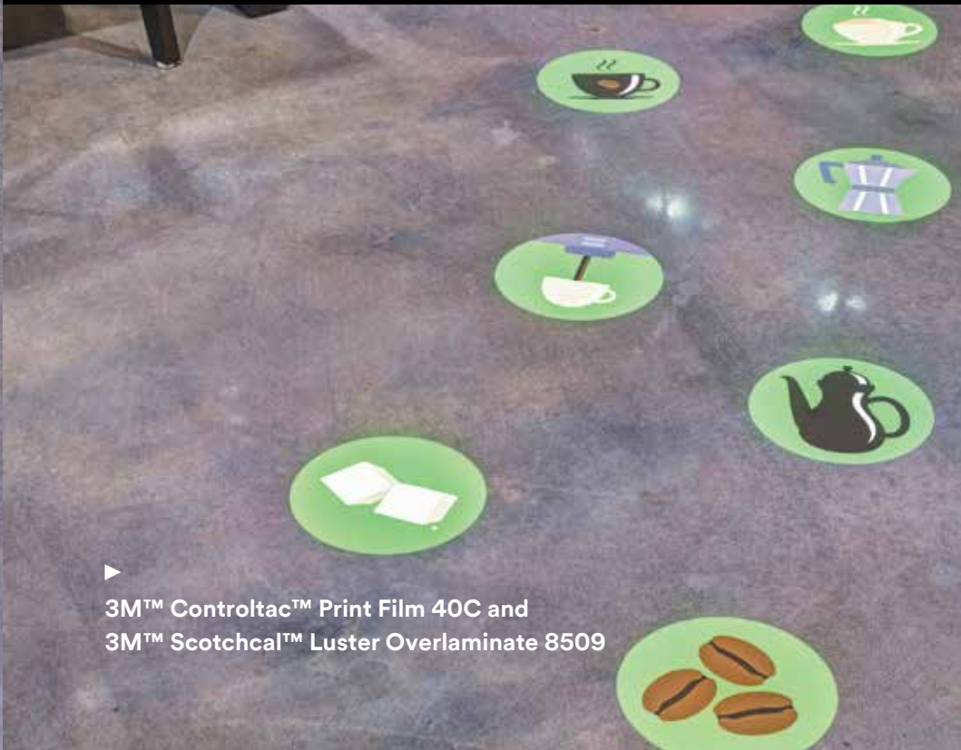
▶ 3M™ Controltac™ Print Film 40C and 3M™ Scotchcal™ Luster Overlaminates 8509