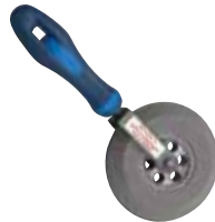
3M™ Vehicle Channel Applicator Tool VCAT-2 Helps to conform film into vehicle channels.