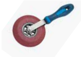
3M™ Textured Surface Applicator TSA-2 Conforms heated film to mortar joints and inside corners.