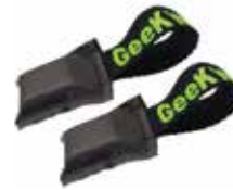
Geek Wraps® Power Slam Magnets Holds film to vehicle during installation without damaging the vehicle or graphics.

All of our Geek Wraps® tools are part of the Certified and Preferred training programs.