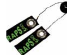
Geek Wraps® Emblem Removal Tool Removes emblems intact without damaging the vehicle's paint.