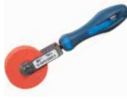
3M™ Textured Surface Applicator TSA-3 Conforms heated film around cut edges and in corners.