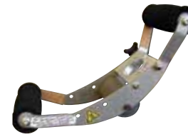
3M™ Two-Handled Textured Surface Applicator TSA-4 for Large Area Increases installation productivity. Requires heat gun (not included).