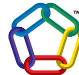
3M™ MCS™ Warranty

For more information, go to 3M.com/graphicswarranties