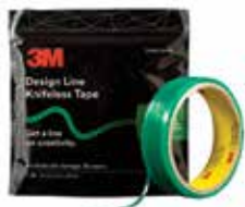
3M™ Design Line Knifeless Tape Engineered to create highly contoured designs with sharp, clean edges.