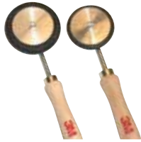
3M™ Roller L (large) 3M™ Roller S (small) Finishing tool for vehicle channels.