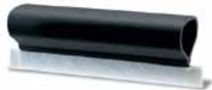
3M™ Power Grip Applicator for 3M™ Comply™ Adhesive Films CPA-1 Covers large areas with uniform pressure distribution.