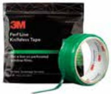
3M™ Perf Line Knifeless Tape Cuts uniform margins between window graphics and rubber moldings.