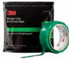
3M™ Bridge Line Knifeless Tape Evenly cuts graphics bridging from one panel to the next.