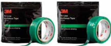
3M™ Tri Line Knifeless Tape (6mm and 9mm) Ensures accurate, consistent stripe width from one end of the vehicle to the other.