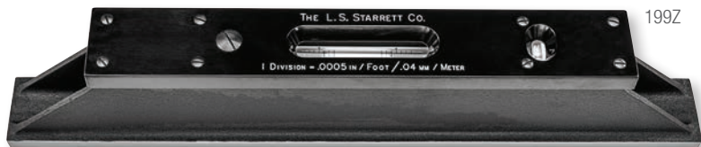
199 Master Precision Level