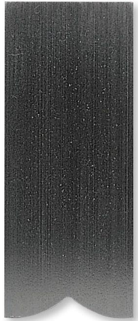
End view showing involute groove

To guarantee extreme accuracy, the length of your level should not be longer than the work you are leveling.